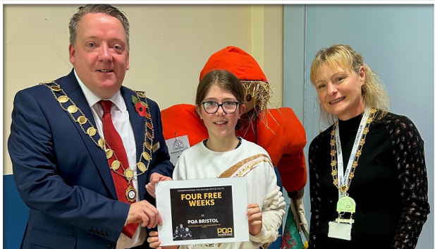
Prize Draw Winner