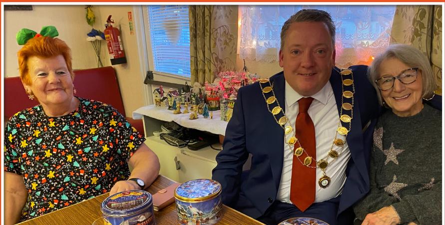
Mayor at Woodlands Park Christmas event