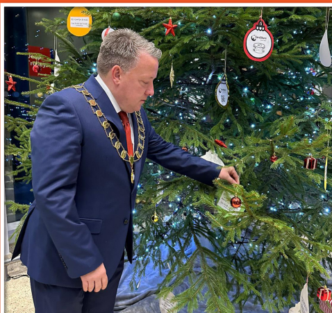
Mayor at Willow Brook Centre Christmas Lights Switch-on