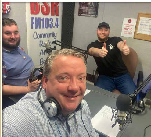
Mayor at Bradley Stoke Radio