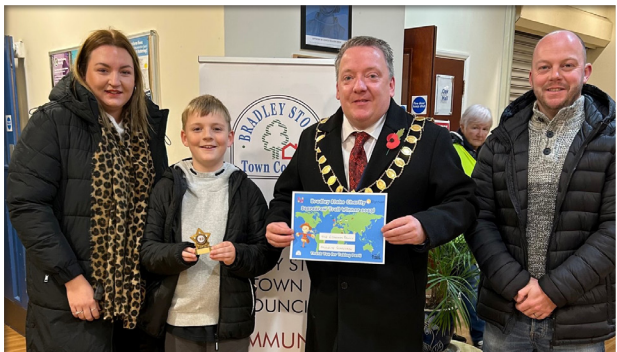
Favourite Scarecrow The Edmonds Family (England)