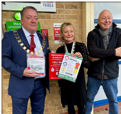
Installation of a bleed kit on the Heartsafe Public Access Defibrillator at Brook Way Activity Centre