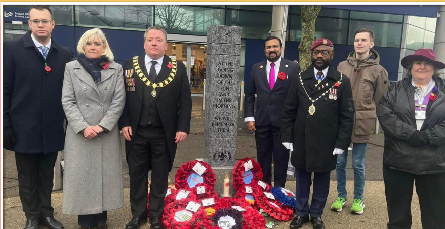
Councillors at Remembrance Day Parade