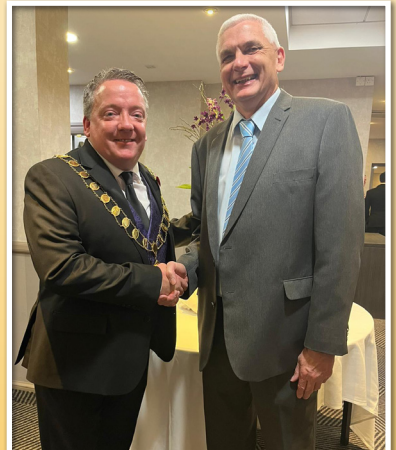
Mayor at Bradley Stoke Youth Football Club 25th Anniversary Dinner