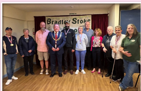
Bradley Stoke in Bloom, Best Front Garden Competition presentation