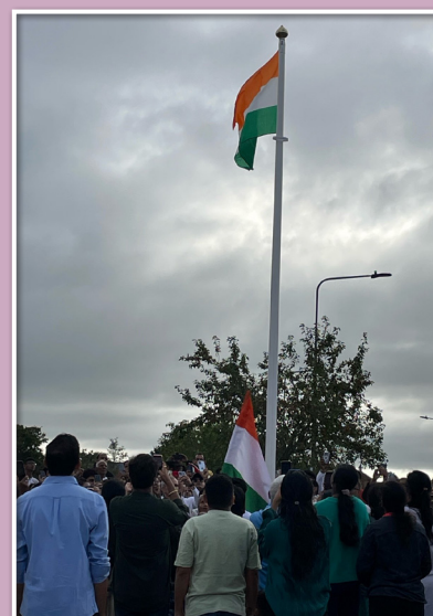
Indian Flag Raising Ceremony