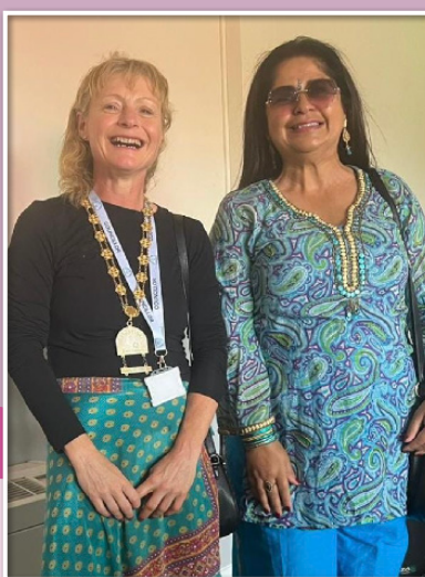
Avon Indian Food Festival