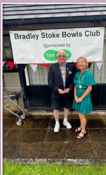
Bowls Club lunch