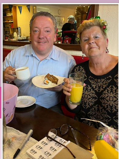
Woodlands Park Residents Christmas Bazaar