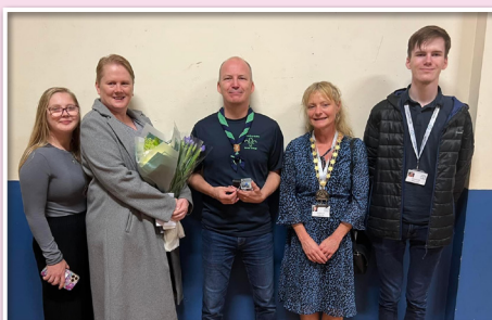
1st Bradley Stoke Scout Group AGM