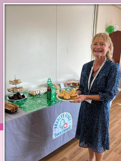
Macmillan Coffee Morning