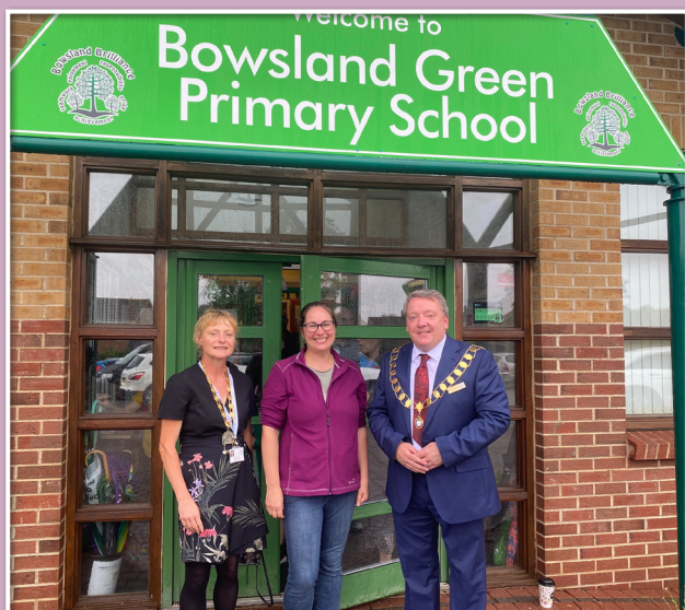
Visit to Bowsland Green Primary School