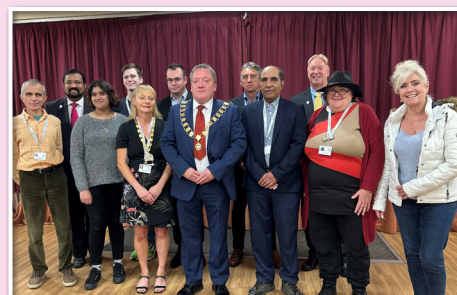
Councillors group photo (unfortunately, some councillors were unavailable for the photo)

Town Councillors surgeries continue on the 2nd and 4th Saturday of every month in various locations – Visit https://www.bradleystoke.gov.uk/events/upcoming-events-and-meetings.php for more information