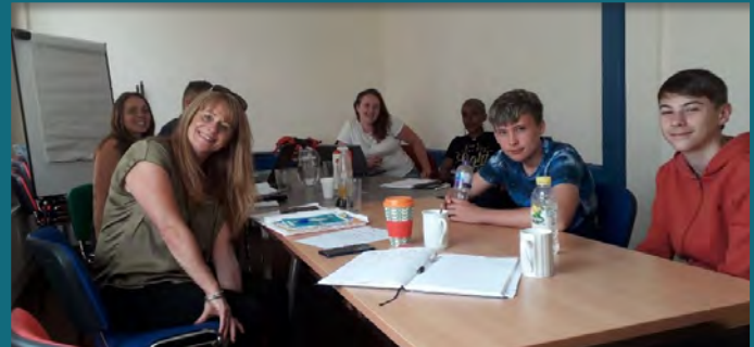
Work experience students attending participation worker meeting