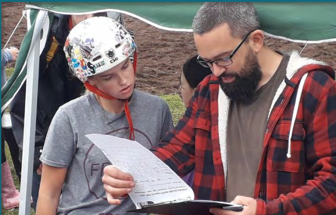
Young volunteer was the main judge at the recent YouthFest in Thornbury