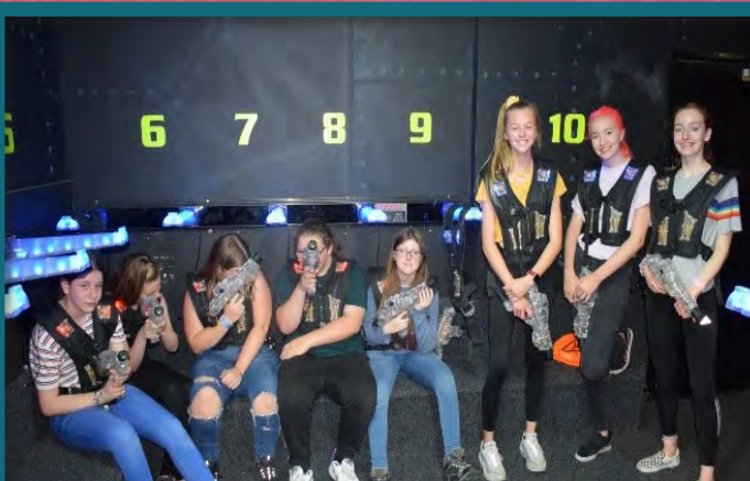
Girls Project Trip to LaserTag