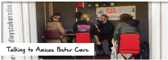
Talking to Amicus Foster Care