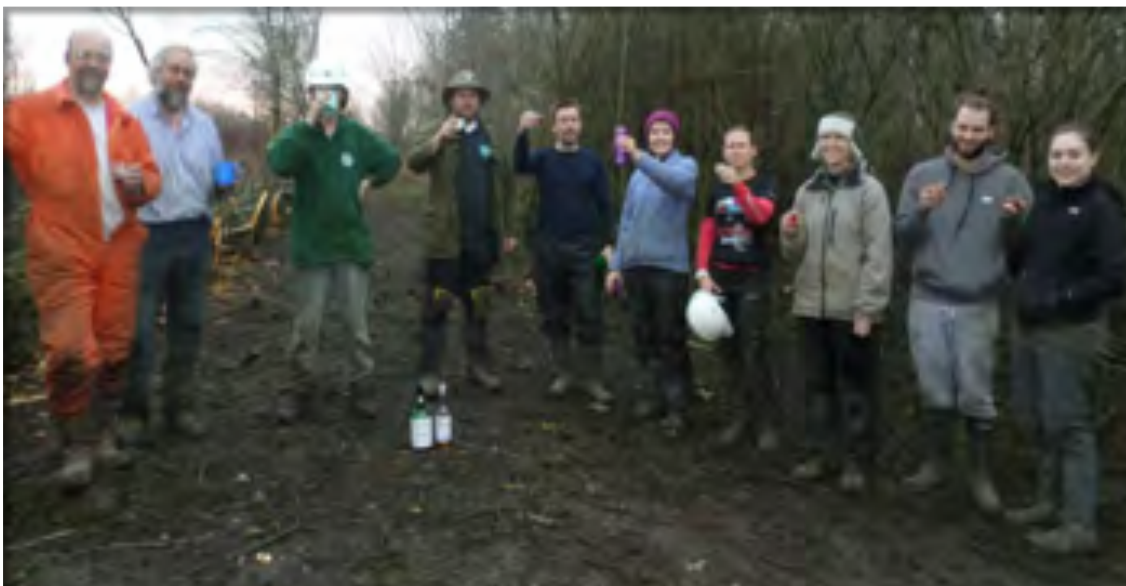
Toasting the new hedge with Sloe Gin made from our very Sloes.