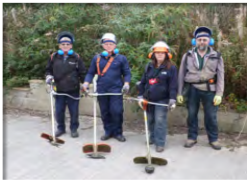
The Green Gym team making a 'Dead hedge'

Some of the reserve trees got into the Christmas spirit!