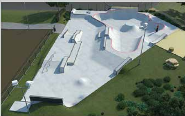
Bradley Stoke Park Skatepark Bradley Stoke, South Gloucestershire - As-Built Design - Visualisation 2

It is anticipated that the build will take between 12 and 16 weeks (dependant on weather conditions).