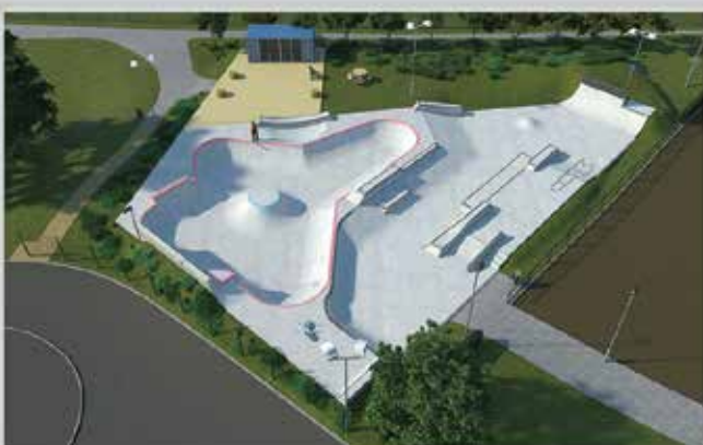
Bradley Stoke Park Skatepark Bradley Stoke, South Gloucestershire - As-Built Design - Visualisation 1