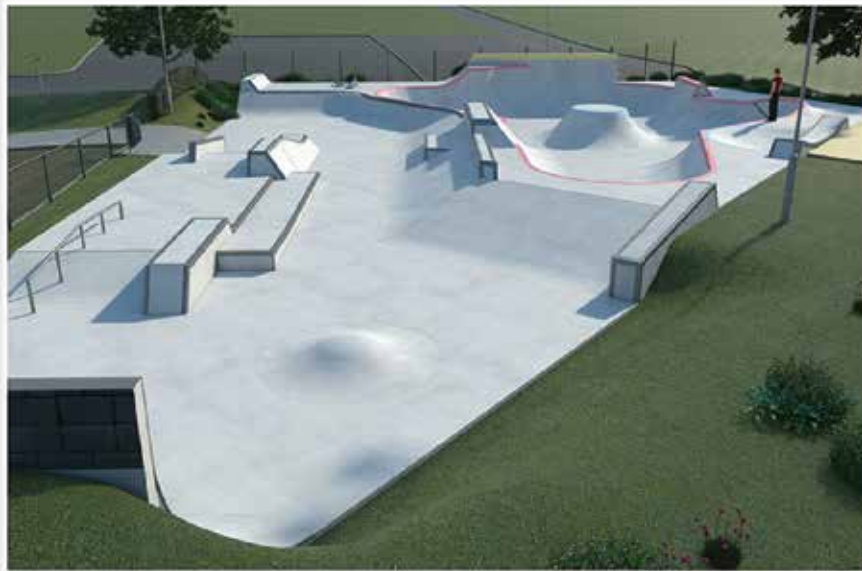
Bradley Stoke Park Skatepark Bradley Stoke, South Gloucestershire - As-Built Design - Visualisation 5