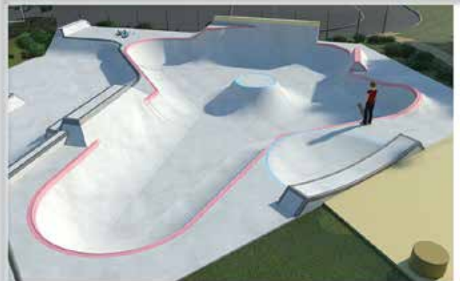
Bradley Stoke Park Skatepark Bradley Stoke, South Gloucestershire - As-Built Design - Visualisation 4