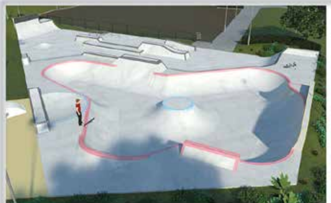
Bradley Stoke Park Skatepark Bradley Stoke, South Gloucestershire - As-Built Design - Visualisation 3